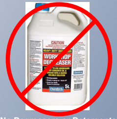
No Degreasers or Detergents